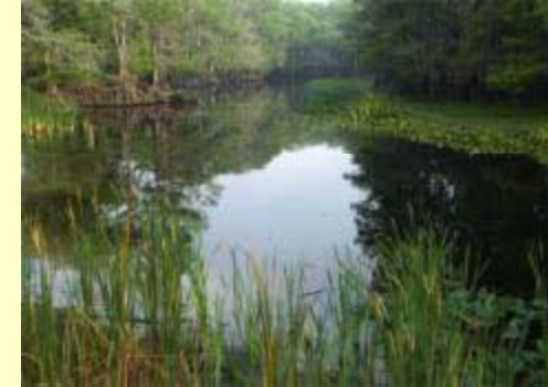
Farmton Tree Farm and Babcock Ranch conservation design