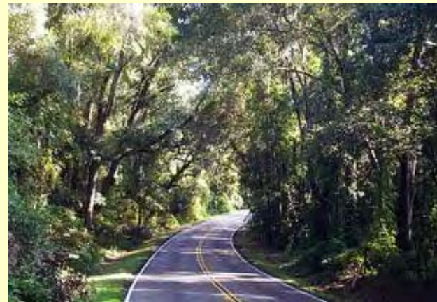
Tree canopy scenic overlay zone in Leon County