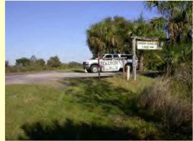
Sarasota County Ag Reserve and Resource Management Area