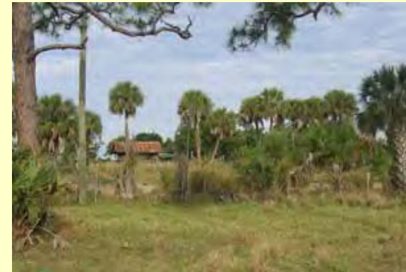
Treasure Hammock Ranch – 1 st property in Florida to receive a conservation easement specifically designed to protect agriculture