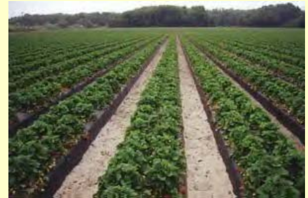
Hillsborough County Ag Industry Development Program