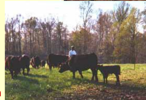
Calvert County MD TDR-PDR program