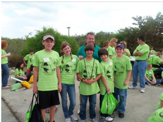
The Envirothon team from Gifford Middle School won first place in the Lagoon Category.