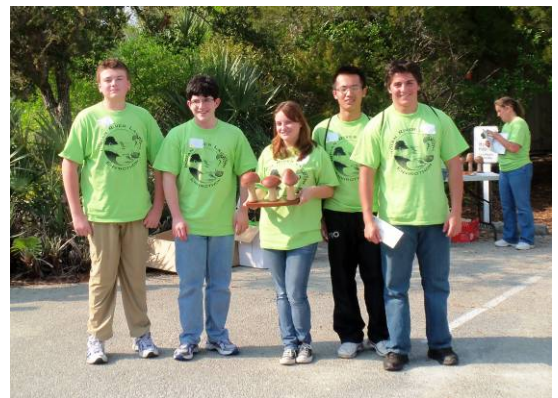
The team from St. Edwards Upper School won first place for Indian River County.