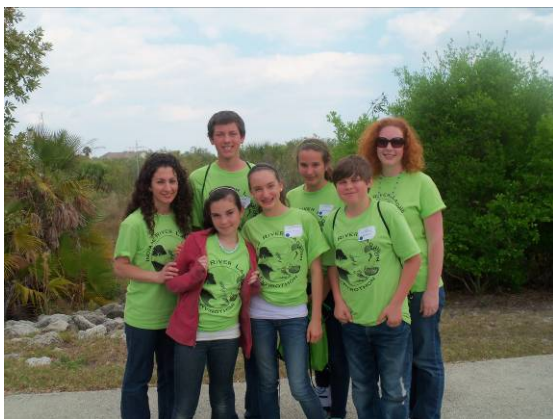
The team from Storm Grove Middle School won first place in the Soils Category.